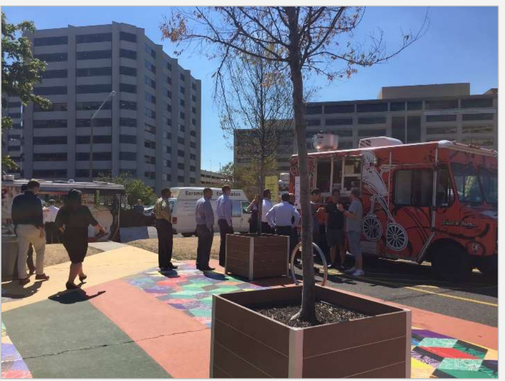
Greensboro Green at The Boro | Tysons, VA