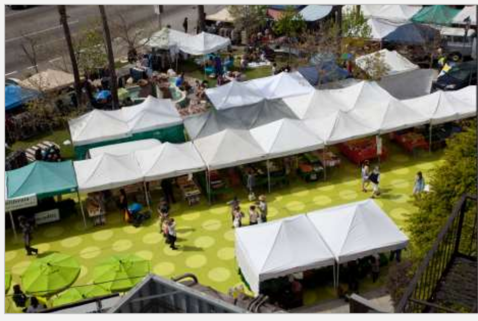
Sunset Triangle Plaza | Los Angeles, CA