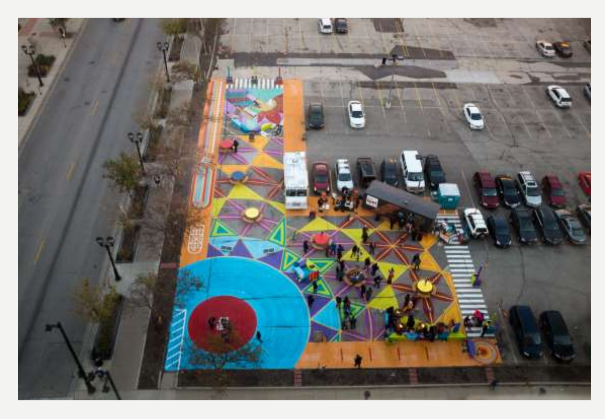
The Spot 4MKE | Milwaukee, WI